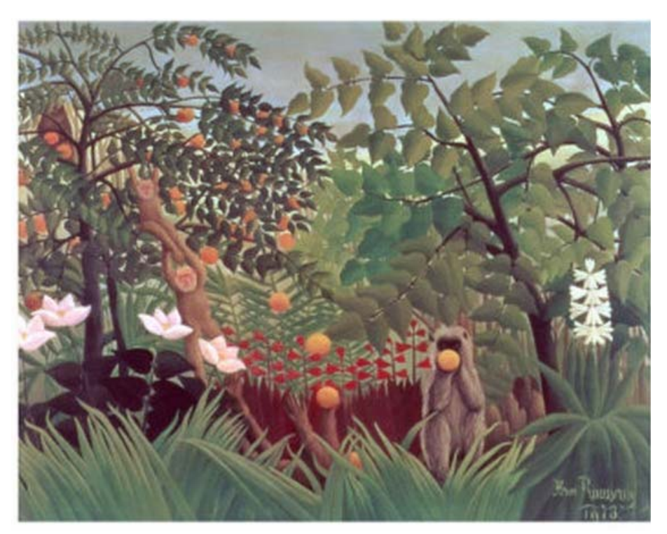
Figure 1: Henri Rousseau, "Exotic landscape", 1910. The artwork ante litteram illustrates the concept of "biodiversity".